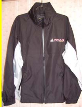
ADULT JACKET $70/$65