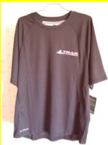
DRY TECH SHIRT $30.00