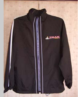
YOUTH JACKET $60/$55