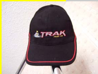
BALL CAP $15