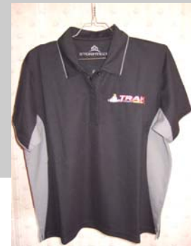
GOLF SHIRT $35